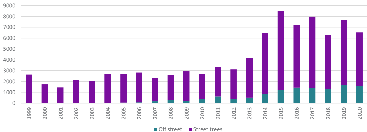
Figure 2: Emerald ash borer sets back Montreal's canopy goals Trees cut down between 1999 and 2020

2013 and 2019 (Grignon-Francke, 2019; Bérubé, 2019; BVGMTL, 2016). An additional $1M was provided to support private ash tree owners. Forest fires, insect infestations, and poor planning practices are among the leading causes of urban tree loss in Canada. Losing trees is expensive and hinders the expansion of the canopy. Strong regulations, strategic planning, and a diverse urban forest can go a long way to keep trees standing.